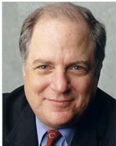
Frank Rich.

OLD GLORY lost today," Bill Frist declaimed last week when his second attempt to rewrite the Constitution in a single month went the way of his happy prognosis for Terri Schiavo. Of course it isn't Old Glory that lost when the flag-burning amendment flamed out. The flag always survives the politicians who wrap themselves in it. What really provoked Mr. Frist's crocodile tears was the foiling of yet another ruse to distract Americans from the wreckage in Iraq. He and his party, eager to change the subject in an election year, just can't let go of their scapegoat strategy. It's illegal Hispanic immigrants, gay couples seeking marital rights, cut-and-run Democrats and rampaging flag burners who have betrayed America's values, not those who bungled a war.