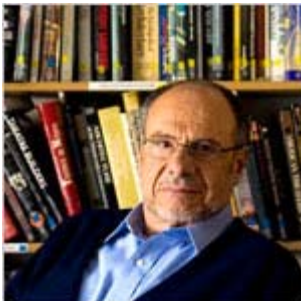
For Volpe, Met Is Not a Final Curtain