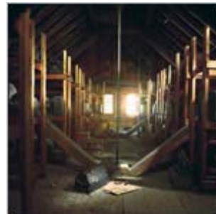
From Forgotten Luggage, Stories of Mental Illness