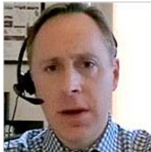
Bloggingheads: Obama on the Couch